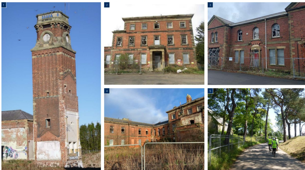
Photos of water tower and other remaining buildings on site (from applicants design and access statement)

dressings under slate roof, comprising a principal central block, housing committee rooms with accommodation for the superintendent on the upper floors, and male and female accommodation wings. The second phase of development, in the late 1880s, included the construction of infirmaries, workshops, an administration block, water tower, recreation hall, bakery, laundry and residences for the steward with cottages and terraced housing for staff. A chapel, named All Saints Church, was built in the grounds in 1863, which was designed by County Surveyor, John Howison. While not listed, the surviving buildings on the former hospital site (early asylum buildings including Superintendent's house, later administrative block, water tower and chapel) have architectural and historic interest due to their age, architectural form, and group value as examples of purpose-built asylum architecture. It is therefore considered that the application site contains historic structures and buildings which have a degree of significance meriting consideration in planning decisions because of their heritage interest and are identified as non-designated heritage assets.